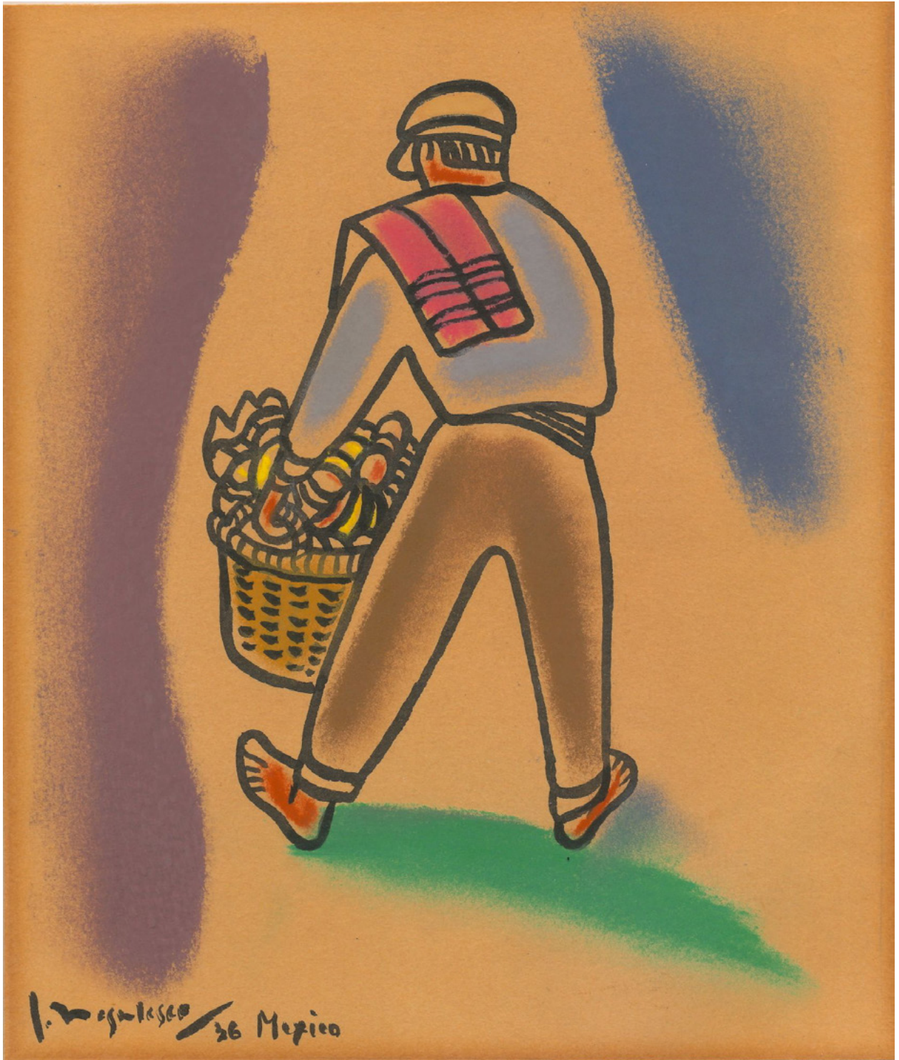
Item #4620. Jean Negulesco pastel drawing